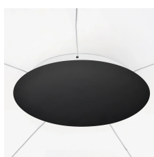
38cm diameter rosette complete with 198W driver