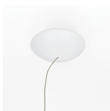
20cm diameter rosette complete with 60W driver