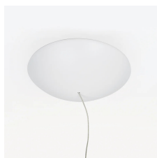
30cm diameter rosette complete with 99W driver